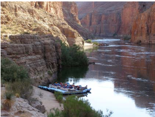
A stop on the Colorado River